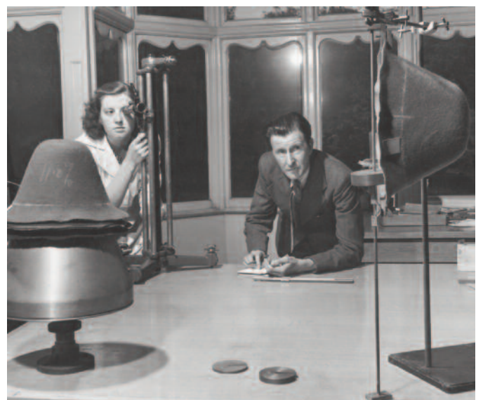
Image: Scientific testing of hats in the 1950s by the British Hat & Allied Feltmakers Research Association. E1656.5